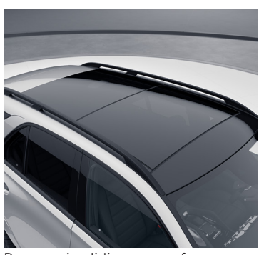
Panoramic sliding sunroof