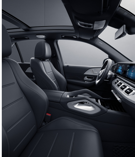
AMG Line interior