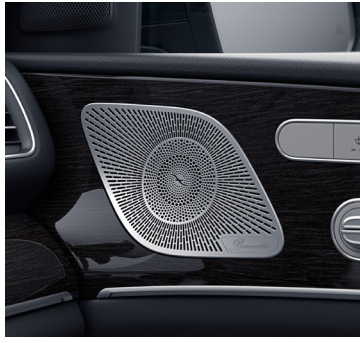
Burmester® surround sound system