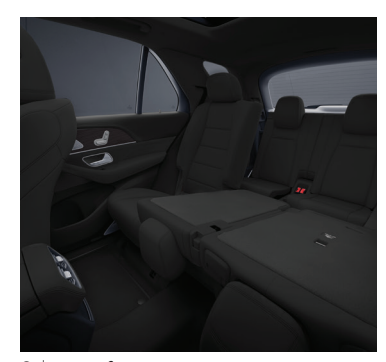
3<sup>rd</sup> row of seats