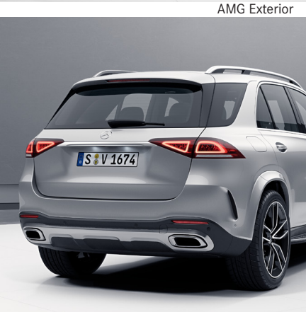
20-inch AMG 5-twin-spoke light-alloy wheels