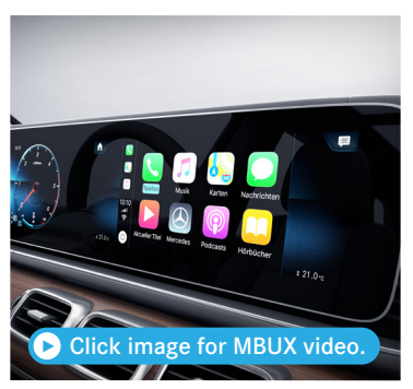
MBUX multimedia system