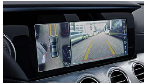
Surround view system