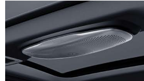
Burmester® high-end 3D surround sound system