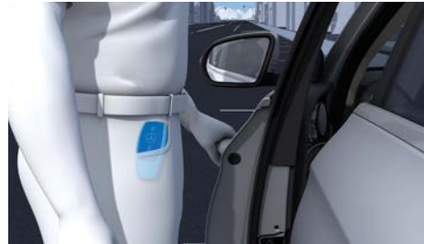
KEYLESS-GO access and starting function