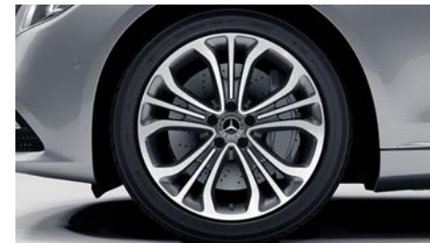
19-inch 15-spoke light-alloy wheels