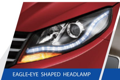
EAGLE-EYE SHAPED HEADLAMP