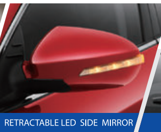
AUTO RETRACTABLE LED SIDE MIRROR