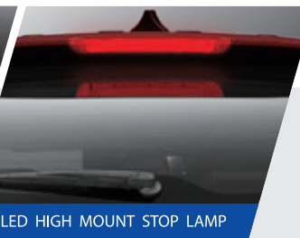
LED HIGH MOUNT STOP LAMP